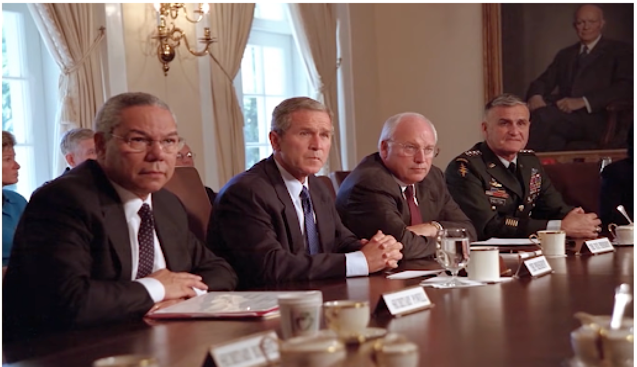
Former USA president George W. Bush and his administration are mainly responsible for the invasion and occupation of Iraq.

The US and UK-led invasion of Iraq was an unlawful war of aggression. Violence between states is prohibited by the UN Charter unless it is authorized by the United Nations Security Council or committed in self-defence. Furthermore, the prohibition against the crime of aggression is a jus cogens norm of international law, inalienable, and which all countries are required to support and sustain. The said jus cogens norm finds life not only in the UN Charter, but also in the Nuremberg Charter, the Tokyo Charter and the Kellogg-Briand Pact.