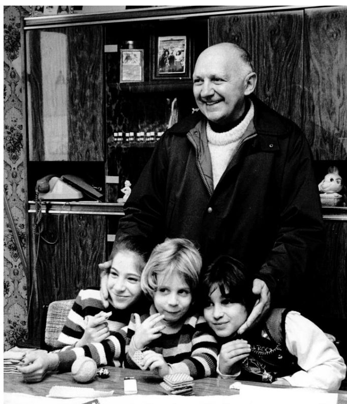
Fr. Joseph Wresinski was born into poverty. He established many important landmarks throughout his life in the fight against extreme poverty.

On October 17th of 1987, Catholic priest: Father Joseph Wresinski launched a Call to Action before approximately 100,000 people at the Trocadéro in Paris, the same place where the Universal Declaration of Human Rights was signed in 1948. The call to action got recorded on a Commemorative Stone at the Human Rights and Liberties Plaza to honour the victims of "hunger, ignorance and violence", affirming that human misery is not ineluctable and urging the world to eradicate poverty. Father Joseph Wresinski's call to action recognized the importance of reaching out to the poorest and building an alliance with citizens to put an end to poverty. In 1992, five years after this public call, the United