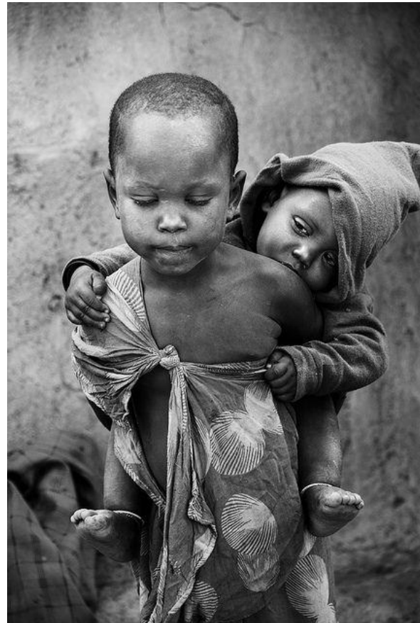
Poverty in Africa

On the other hand, high levels of poverty are often associated with conflict-affected countries. Based on recent data on the Global Finance Magazine's compilation of the World Bank sources 9 , it can be evident that the most fragile economies have recently been through a civil war or are still suffering from ongoing conflicts: ranking the Central African Republic, Congo, Burundi and Liberia as the poorest countries in the world.