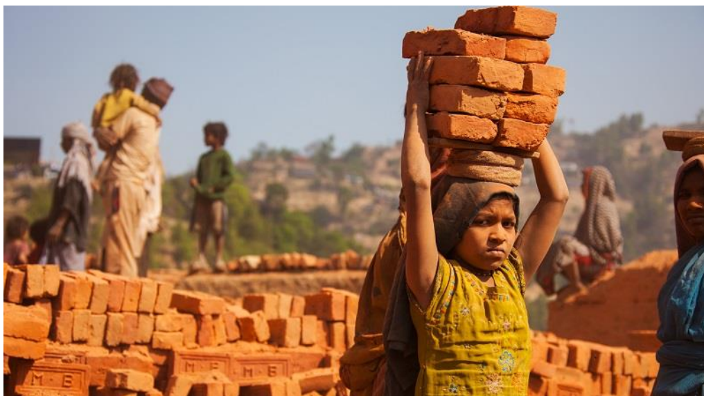
Child Labour in India

However, from families to communities, from cities to entire nations, poverty remains flaming in all societies, hampering the enjoyment of the most fundamental rights for people, including food-security, and the right to health and well-being. Due to extreme levels of poverty, children are subjected to lose their right to education because they lack the financial means to go to school and therefore have to assume the role, at a very young age, of being their families' financial supporters, which goes in contravention to other children's human rights treaties and declarations, including the prohibition of child labour.