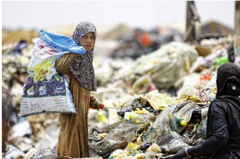
An Iraqi girl searches through garbage for recyclable items on June 10, 2014, at a waste dump on the outskirts of the shrine city of Najaf, in central Iraq.

Furthermore, GICJ notes that both the UDHR, and the International Covenant on Economic, Social and Cultural Rights-(ICESCR) proclaim the right of everyone to gain their living by working; the right to an adequate standard of living; and the right to education.