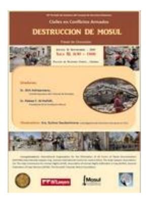
Leer en línea o Descargar el Reporte Completo.