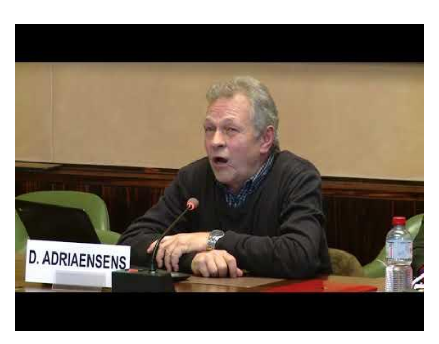
Watch the full side-event in English or Arabic.