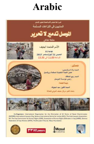
أو تحميل قراءة على الانترنت التقرير الكامل