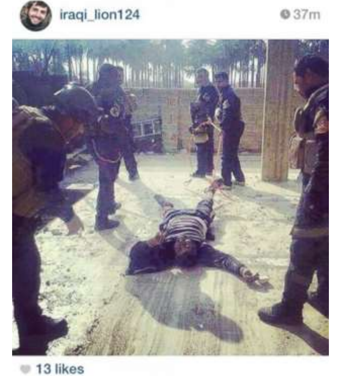
Γorture by Iraqi army