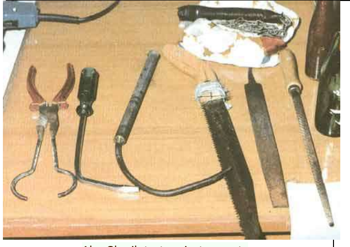
Abu Ghraib torture instruments