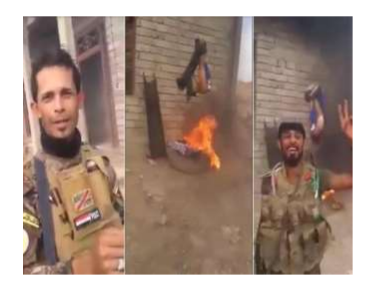
Torture by the militias linked to the government